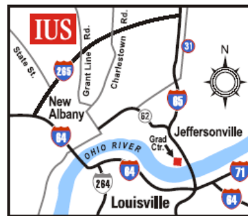
MAP TO CAMPUS

IU Southeast is one of eight campuses of Indiana University. Offering over 50 degree programs, the scenic 177-acre campus is located less than 15 minutes from downtown Louisville, Kentucky and currently has an enrollment over 6,800 students and close to 200 full-time faculty members.