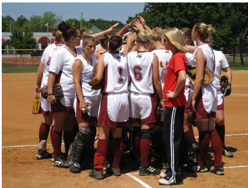
2008 NAIA Softball National Championship – Decatur, Ala.