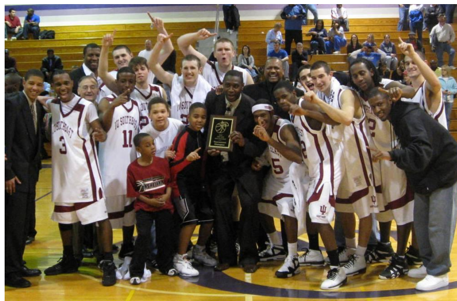
2007-08 Men's Basketball KIAC Tournament Champions